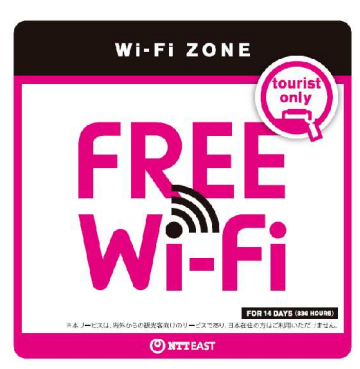
Free Wi-Fi logo

Around 50% of international tourists to Japan wish to use Free Wi-Fi*2. In response to it, free public wireless LAN environment has been developed in many areas such as airports, railway stations, and convenience stores etc. To introduce more convenient services to tourists visiting Japan, JAL takes this new challenge to cooperate with NTT East, who has "Hikari Station" hotspots located at more than 46,000*3 shops and facilities in the eastern Japan*4, to enable tourists to use Free Wi-Fi service during short visit to Japan.