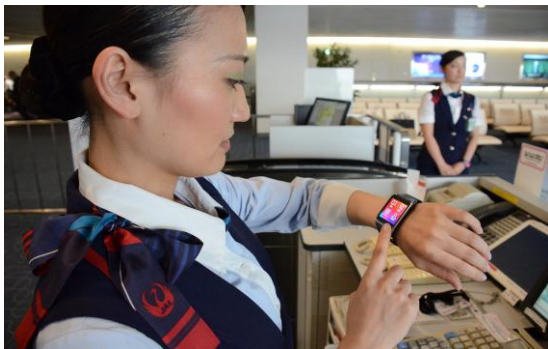
JAL staff wearing smartwatch

*3. Wearable device: Miniature electronic devices that are worn by the bearer under, with or on top of clothing with features such as picture display, cell phone and emailing etc.