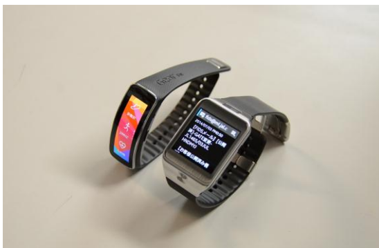
Smartwatches provided by NTT DOCOMO, INC.

(SAMSUNG’s GALAXY Gear Fit/left, GALAXY Gear2/right)