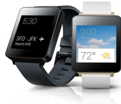
LG G Watch

JAL strives to provide customers with new and innovative products and services under the banner “Embrace new challenges JAL”.