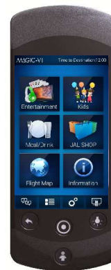
Controller of in-flight entertainment in Business Class