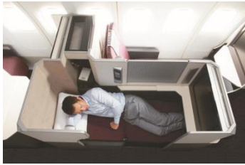
<JAL SKY SUITE>