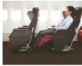
<JAL SKY PREMIUM>