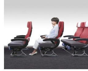
<JAL SKY WIDER II>

For more information about seating aboard the “JAL SKY SUITE 787”, visit press release: http://press.jal.co.jp/en/release/201409/003069.html