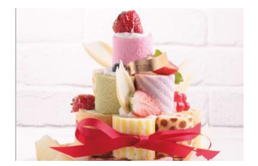
Roll Cake Tower from Irina

This is part of "<u>Discover Gourmet Japan</u>", an event on <u>Rakuten Global Market</u> dedicated to helping food lovers discover exotic Japanese flavours. Other products offered here include premium frozen seafood, fruits and sake selected from Rakuten Ichiba merchants. The marketplace will continue to explore parterships with more food merchants, as it aims to introduce more Japanese delicacies to the world.