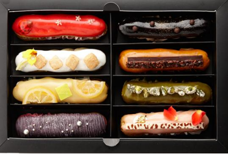
Éclair Art from Louange Tokyo