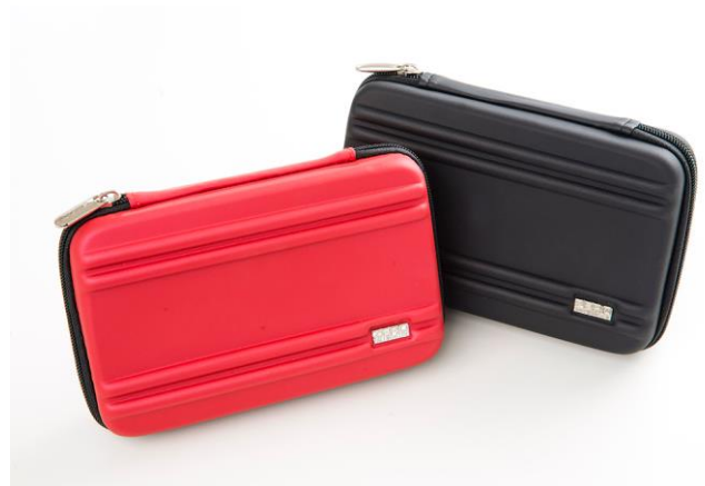
<Semi-hard case on inbound flights>