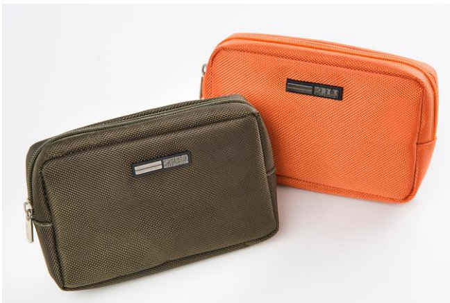
<Soft case on outbound flights>

JAL continues to embrace new challenges to deliver a refreshing and innovative travel experience to customers.