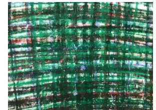
Artwork to be used

The JAL Group will continue to create various “connections” on the world stage by further extending collaborations and promoting initiatives in various areas with HERALBONY, aiming to realize a society where everyone can enjoy a fruitful life through travel.