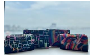
First Class Amenities