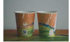
Inflight paper cups (*Image)