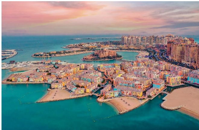
The unique city that blends modernity and tradition

Doha, the capital of Qatar, is a unique city that blends modernity and tradition. While preserving its own culture, the city offers modern facilities, hotels and infrastructure for immigrants and travelers, along with a mix of cultures and cuisines from different countries. Travelers can also enjoy a variety of activities such as desert tours, museums with historical treasures, and sporting events such as Formula 1 and soccer.