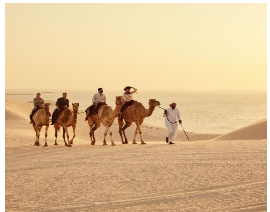
Travelers can enjoy adventuring in the desert