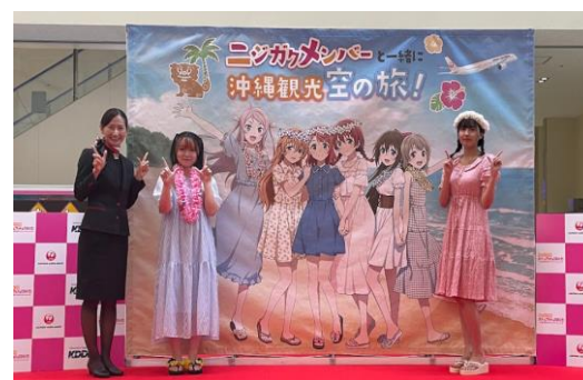
Last Year's Event at Okinawa (Naha) Airport

Event details will be announced on the portal site once finalized.