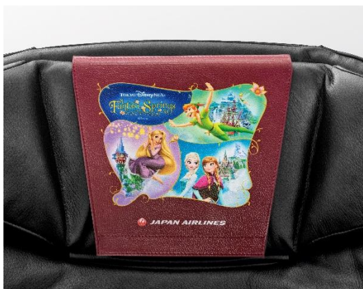
Headrest cover (red) - Available on Class J seats