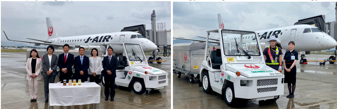
Photo session from the launch day (*1) Yamagata Airport: Ground handling staff and vehicle

—Upcycling byproducts into renewable energy through world-first technology—