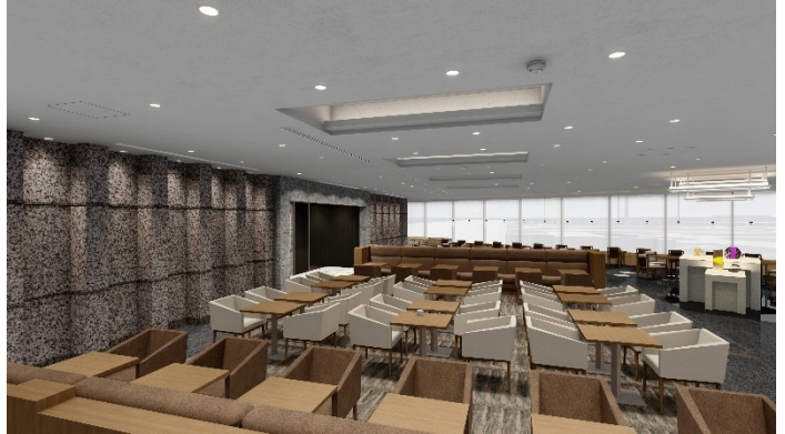
Various seating arranged in an open space