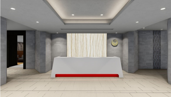
Stately and serene entrance

The new lounge will provide a bright and open space where each and every one of you can relax more comfortably.