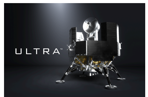
ispace’s ULTRA lunar lander scheduled for Mission 3.

Officially named "The ARGO Trans-Lunar Heritage Project," and embodying the concept of “The Ark Relaying for Generations Onward ,” this project is inspired by the constellation Argo Navis, which represents a great sailing ship. It aims to pass on precious cultural heritage and human activities to future lunar inhabitants.