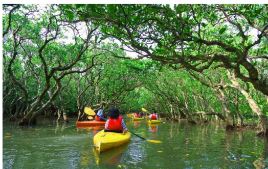
Mangrove forest in Amami Oshima (Image)

Tour price (per person): From JPY290,000 (2 people per room or 3 people per room)