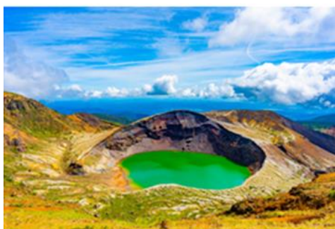
The volcanic crater of Mt. Zao (Image)

Tour price (per person): From JPY240,000 (2 people per room or 3 people per room)