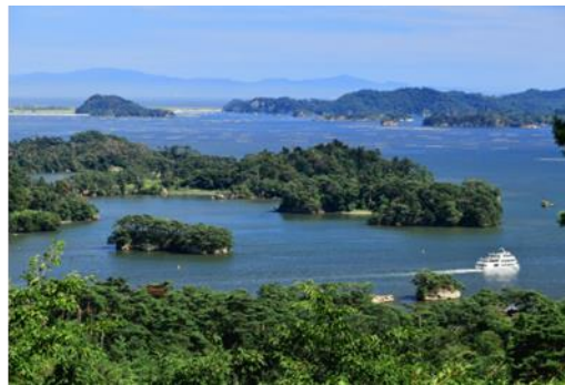
Matsushima Islands, Tohoku (Image)

The number of foreign visitors to Japan in 2024 is expected to reach 36.87 million (*1), exceeding the previous record of 2019 by approximately 5 million, setting a new annual record. However, many of these visitors are concentrated in a few cities such as Tokyo, Kyoto, and Osaka, and overtourism in some areas is a serious issue, causing excessive congestion, poor manners, and impacts on local residents, as well as reduced satisfaction among travelers.