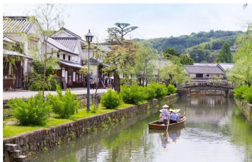
Kurashiki Bikan Historical Quarter (Image)

Tour price (per person): From JPY198,000 (2 people per room or 3 people per room)