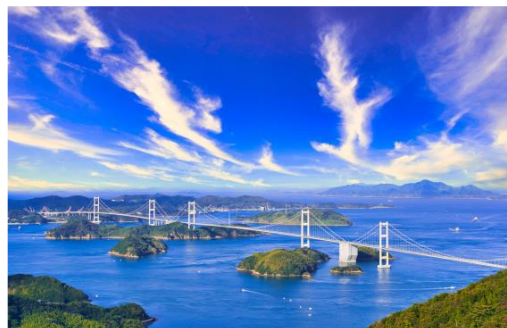
Shimanami Kaido and the islands of the Seto Inland Sea (Image)