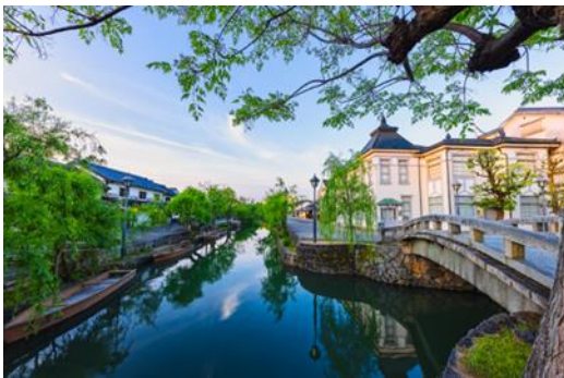
Kurashiki Bikan Historical Quarter (Image)