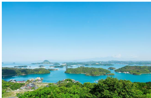
Matsushima, one of the Three Most Scenic Spots of Japan (image)