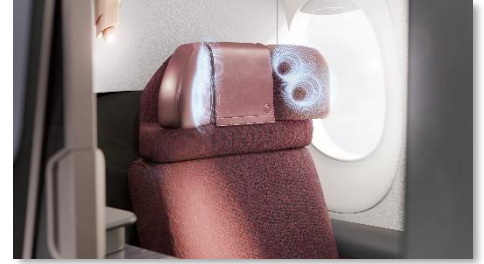
The world's first headphone-free stereo with built-in headrest speakers

Starting from the same day, newly renewed disembarkation videos will be introduced on all JAL domestic and international routes, marking the first update in 12 years. These videos feature individuals who play active roles in various fields of culture and technology across Japan, emphasizing the essence of Japan and JAL through their delicate skills and gestures. While it may only be a brief moment when disembarking, customers are encouraged to take a moment to enjoy this video as a delightful conclusion to the journey.