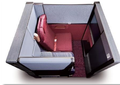
A350-1000 Business Class