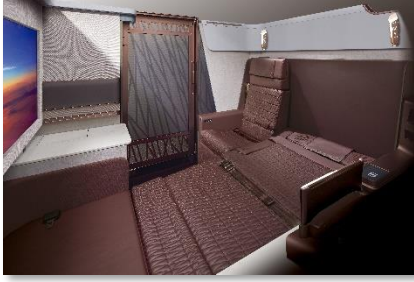
A350-1000 First Class