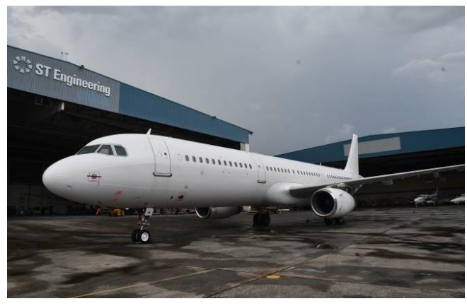
< Aircraft No.1 before the conversion (MSN4173) >