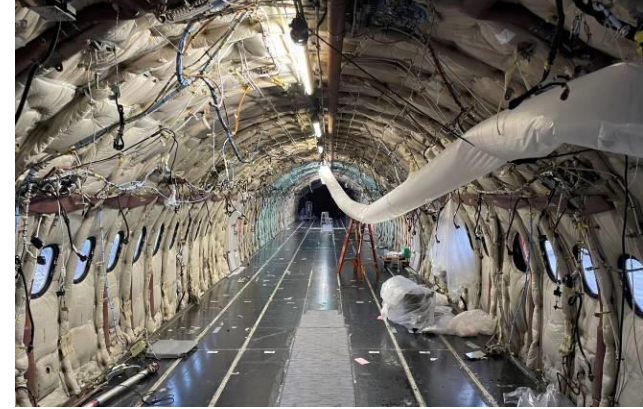
< Aircraft stored in a hangar >