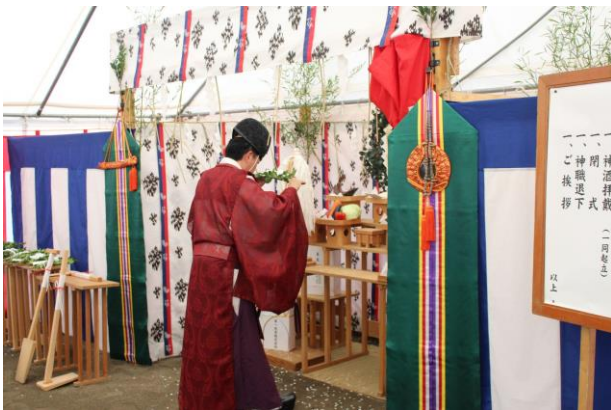
Groundbreaking ceremony of the demonstration plant

On October 3, 2025, a groundbreaking ceremony called "Jichin-sai" was held at the demonstration plant site within Nippon Paper's Iwanuma mill. The plant is scheduled for completion in fiscal year 2026, with plans to operate a commercial facility capable of producing tens of thousands of kiloliters of bioethanol and biochemical products annually by 2030.