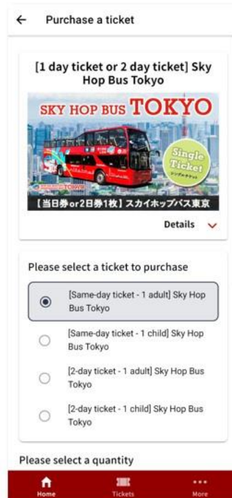
2. Purchase screen