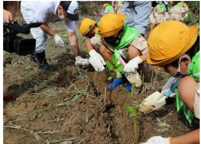
(Tree planting by local elementary school students (2021)) Joint Release: September 19, 2023 Ukenmura in Amami Oshima, Sophia University, ITOCHU Corporation, and JAL conclude industry-academia-government collaboration agreement on environmental conservation and regional development (Japanese only)

The JAL Group has been actively promoting various initiatives to ensure the conservation of species through the prevention of illegal wildlife trade, the maintenance of ecosystems through plant quarantine, and the preservation of natural resources at World Natural Heritage sites. These efforts reflect JAL's strong dedication to passing on a prosperous Earth to future generations. Looking ahead, JAL will further enhance its existing efforts to achieve Nature Positive and actively work towards building a society where nature and people coexist harmoniously through our business activities.